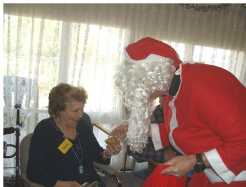
Members' Christmas party