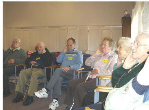
Brain gym participants in action